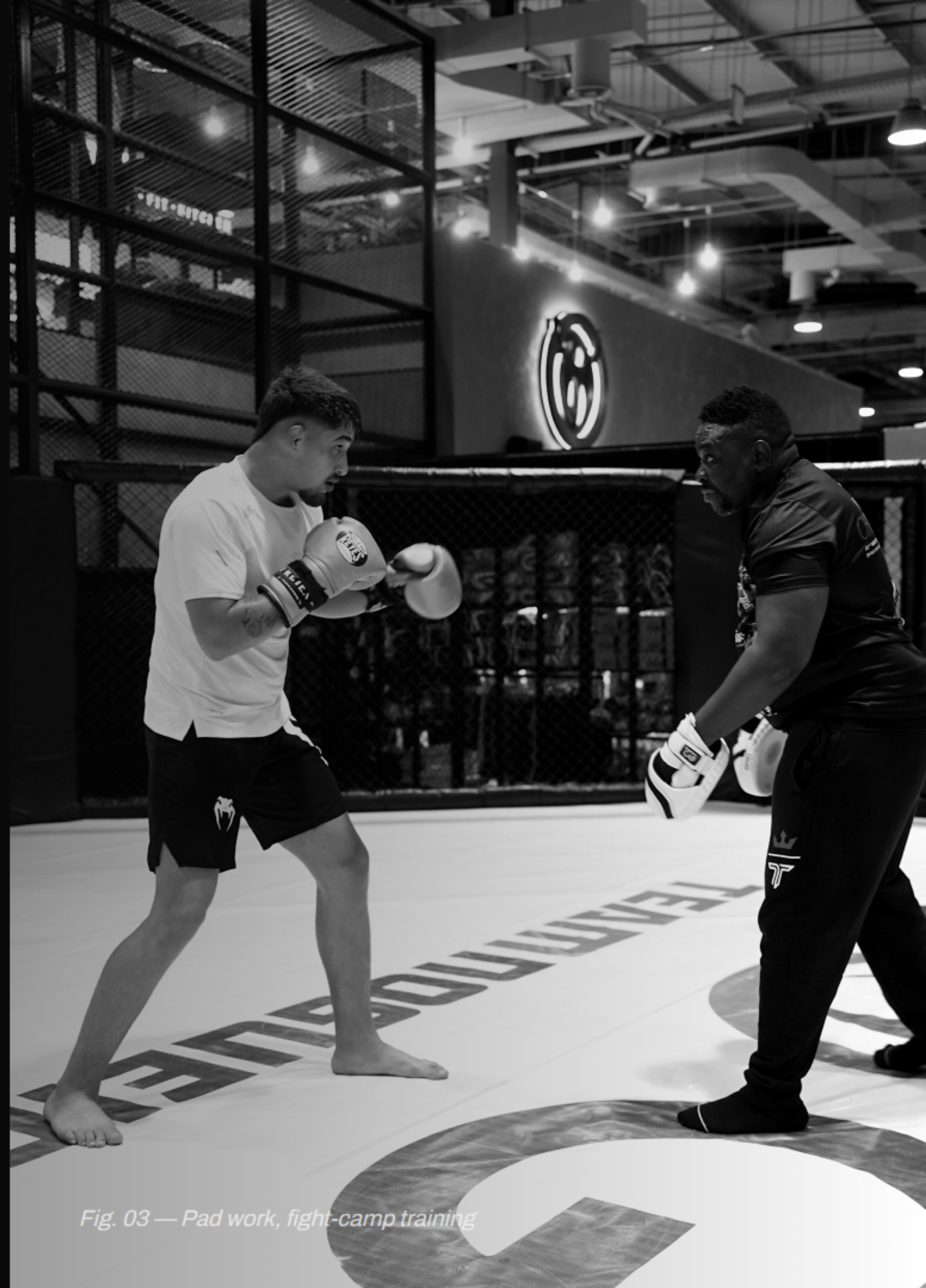
Fig. 03 — Pad work, fight-camp training

Brand named in Kourosch's pre-fight walkout video played to the live Geelong Arena crowd.